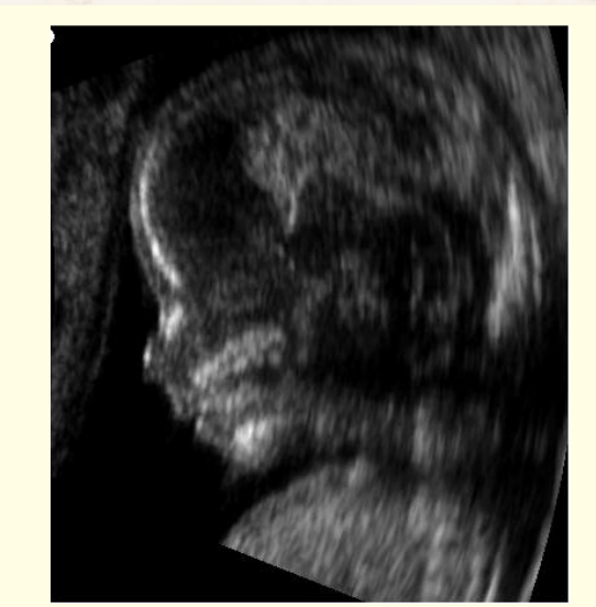
Ultrasound_range_diagram.svg Fetal ultrasound has increased.