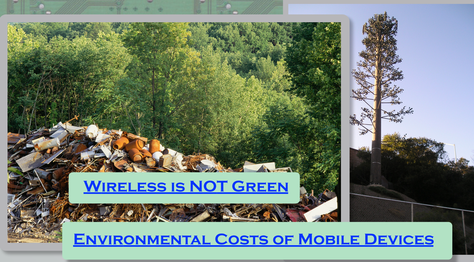
WIRELESS IS NOT GREEN